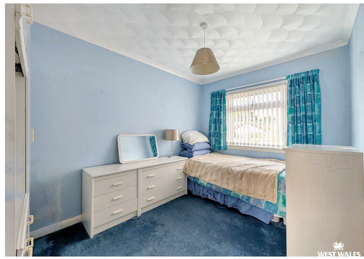
Chain Free – 3-Bedroom Detached Bungalow, Kidwelly

Nestled in the charming town of Kidwelly, this well-presented 3-bedroom detached bungalow offers a fantastic opportunity for comfortable, single-level living with scope to expand. Situated in a residential area with easy access to local amenities, the property benefits from off-road parking and a garage—ideal for secure storage or further development.